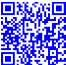
2024 Association of Water Board Directors Preparedness PSA Video on YouTube

After such a long and hot summer and unseasonably warm October and November, it may seem like any cold weather is welcomed with open arms. But let's not forget the severe cold we went through just a couple of years ago. It is always best to be prepared, so now is the time to winterize your home for the coming months. We have added some helpful information on the District website under the Residential Water and Sewer tab that outlines some basic precautions to take for winterizing your home as well as some diagrams for different types of water shut off valves that you may have in your home. Take the time to really prep for potentially freezing weather so you can hopefully save yourself the costly repair bills that come from burst pipes.